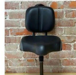
Travel Seat with Backrest