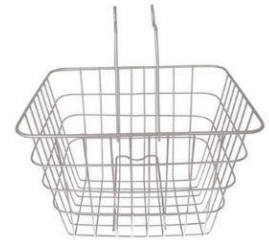
Front Wire Basket