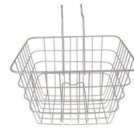
Front Wire Basket