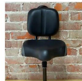
Travel Seat with Backrest